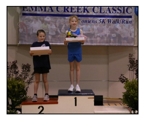
8 & YOUNGER WINNERS